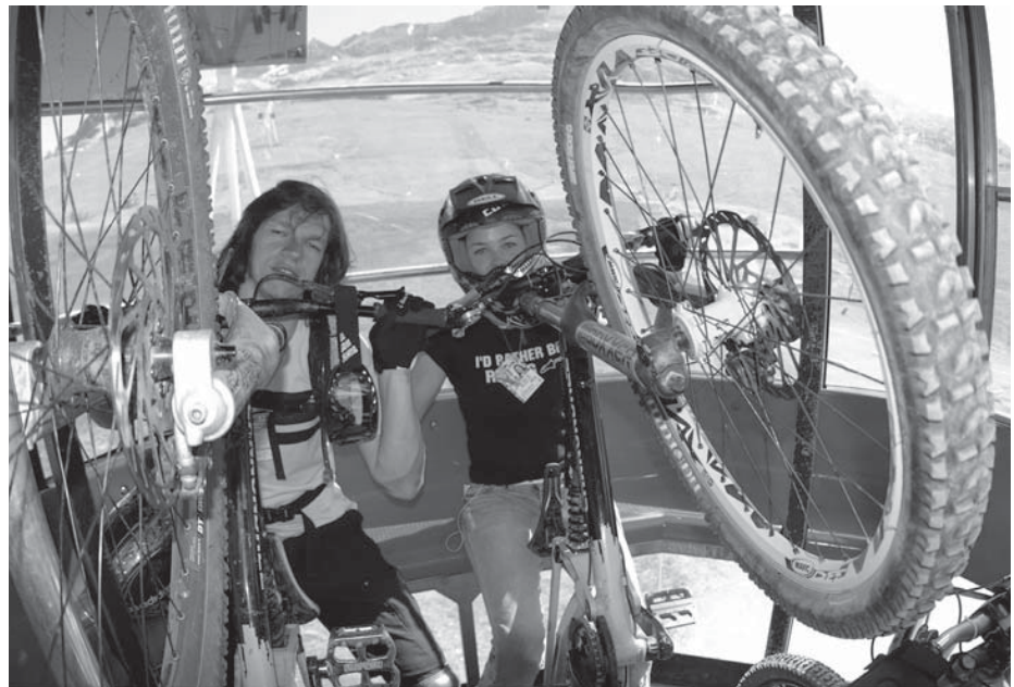
Latitudes, Credit: Courtesy of Don Hampton. Courtesy of The Banff Centre

The film follows a group of slackliners as they test their skills in amazing locations.