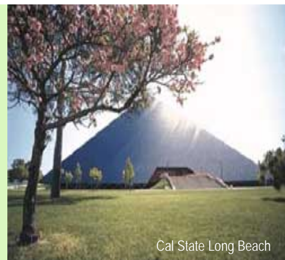
Cal State Long Beach

UC campuses are accepting fall 2007 transfer requests starting November 1 through November 30, 2006. The UC application is completed online at www.ucpathways.edu . There is a personal essay required for the UC campuses. Sample essays are available in the OCC Transfer Center. ■