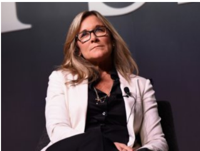
Apple's retail chief, Angela Ahrendts, is leaving